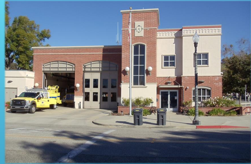
Fire Station 42