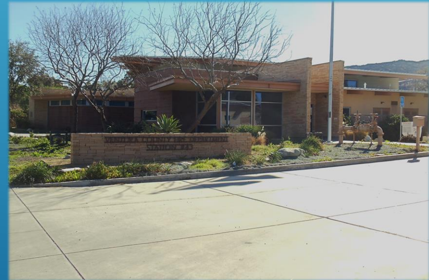
Fire Station 43